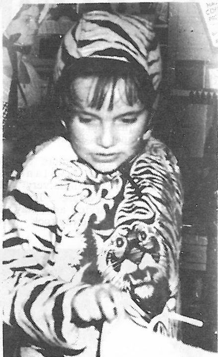
THIS YOUNG LADY SEEMS TO BE FASCINATED BY SOME OBJECT IN ONE OF THE SCHOOLROOMS AT SATURDAY NIGHT'S BIG HALLOWEEN PARTY. THEY CAME IN ALL TYPES OF COSTUMES, TOO, AND HAD A BARREL OF FUN.